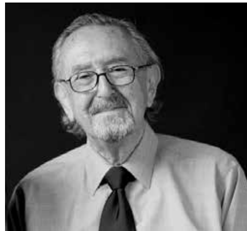
CÉSAR PELLI PELLI CLARKE PELLI

In 2000, New York's Guggenheim Museum celebrated Mr. Armani's career with an exhibition that has since been seen worldwide, including at the Guggenheim Bilbao, London's Royal Academy of Arts, Berlin's Neue Nationalgalerie, Rome's Terme di Diocleziano, Tokyo's Mori Arts Museum and The Shanghai Art Museum.