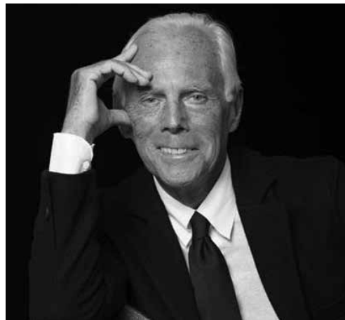
GIORGIO ARMANI ARMANI/CASA

Giorgio Armani is the president and CEO of one of the world's leading fashion and lifestyle design houses. He presides over a stable of collections that includes his signature Giorgio Armani line, Giorgio Armani Privé, Armani Collezioni, Emporio Armani, AJ I Armani Jeans, A/X Armani Exchange, and Armani/Casa. Mr. Armani's interior design work includes a series of Armani Hotels & Resorts created with Emaar Properties, for which he defined the style and mood of a new international chain of hotels, resorts, and luxury residences in the world's leading cities and tourist destinations.