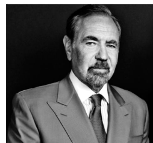
JORGE M. PÉREZ THE RELATED GROUP

The firm's work has been internationally recognized with hundreds of awards for design excellence, including over 40 design awards from national, regional and local chapters of the American Institute of Architects. In 2004, the firm was given the Aga Khan Award for Architecture for the Petronas Towers. In 1995, the AIA awarded César Pelli the Gold Medal, which recognizes a lifetime of distinguished achievement and outstanding contributions. In 1991, César Pelli was selected as one of the 10 most influential living American architects. In 1989, Pelli Clarke Pelli was the recipient of the AIA's Firm Award.